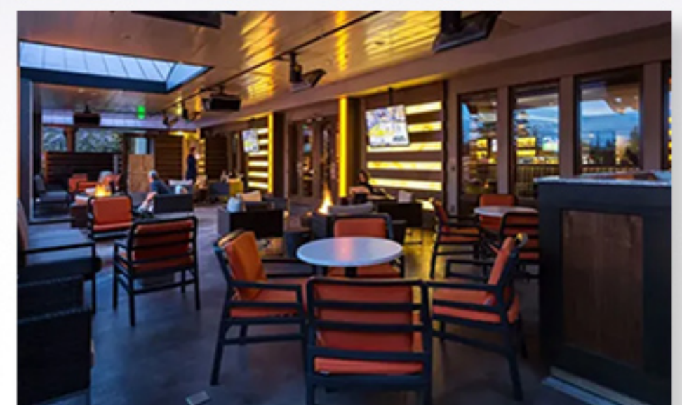
MODERNIZED SEATING AREAS