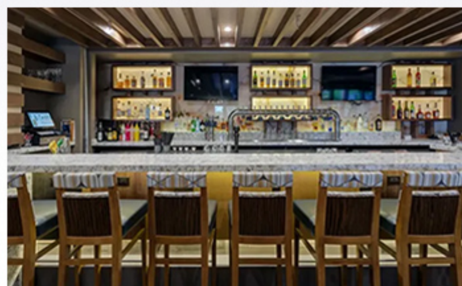
NEWLY REMODELED BAR