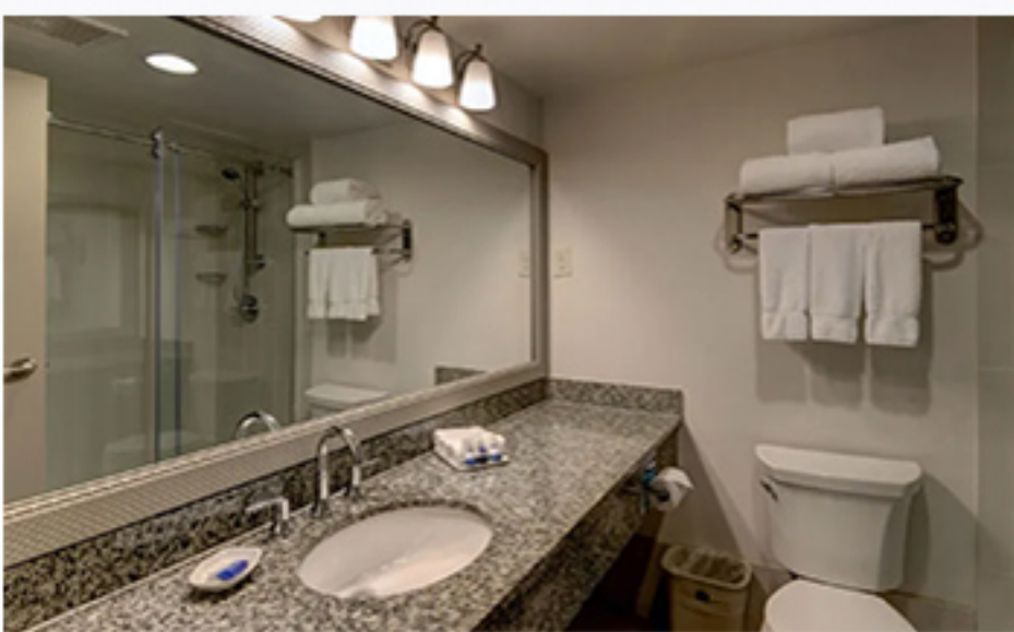
NEW BATHROOMS & TILEWORK

Phase 2: Pool Area. Scope included all new finishes in the Pool Area, new uni-sex restroom, additional ventilation and on deck shower area. The new skylight system has created daylighting to almost an outdoor feel.